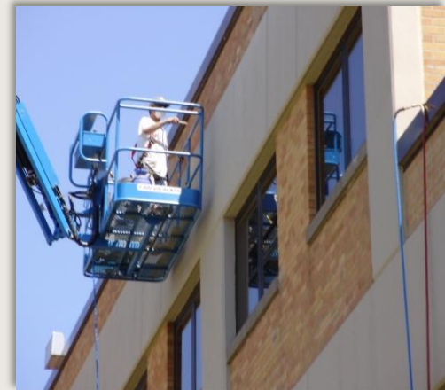
Exterior wall repairs at Ellsworth AFB, SD